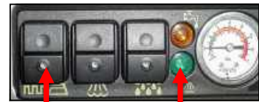
Power Steam Ready

During use, the green Steam Ready light will blink indicating the boiler is heating.