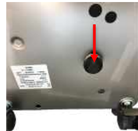
Remove Drain Plug (figure 2)