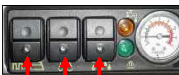
Hot Water Injection