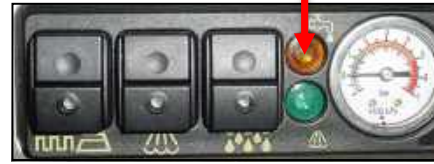
Low Water Light