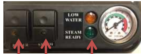
ON/OFF STEAM READY

During use, the Steam Ready light may blink indicating the boiler is heating.